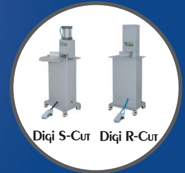
Digi S-Cut Digi R-Cut