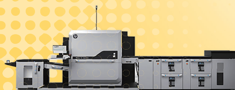
HP Indigo 15K

2 Station Full Face Coating and Spot Coating UV / Aqueous Varnish & Primer for HP Indigo 15K / 12000